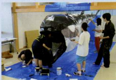
✦ high-school student working together

this year, "Muroto UNESCO Global Geopark Deep Sea Expo 2016" is being held to make it possible to fully enjoy the deep sea of Muroto. At Muroto Global Geopark Center, there are exhibitions of the deep sea and deep-sea creatures, such as videos and real specimens. The main exhibition is a mock-up of a huge deep-sea shark, known as the "mega-mouth shark." A group of students at Muroto High School joined together to make this mock-up. You will be overwhelmed by the size of it for sure. You can also encounter deep-sea creatures at "Aqua Farm," the deep seawater intake facility. At "Sea-rest Muroto," a hot bath relaxation facility using deep seawater, you can experience feeling like a deep-sea fish. For lunch, you can enjoy "Muroto Kinme Don," Muroto's premier dish, which is made with kinme, or alfonsino—a deep-sea fish.