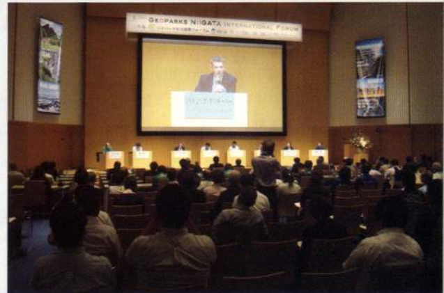
✦ A panel discussion concluded the two day forum