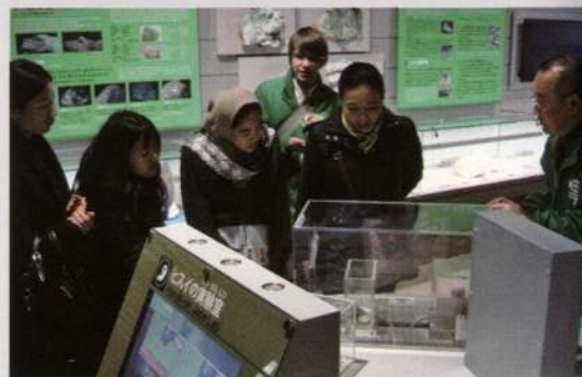
◆ Participants learn about jade and the formation of the Japanese Islands in the Fossa Magna Museum

The tour culminated in an excursion to the Oyashirazu Geosite, where the Northern Japanese Alps collapse directly into the Sea of Japan. This impressive geological formation, a relic from when Japan was attached to the Asia mainland, formed a natural boundary throughout Japan's history. Through participating in exchange programs like this one, the Itoigawa UNESCO Global Geopark hopes to continue to spread the Global Geopark model and facilitate networking among Geopark regions.