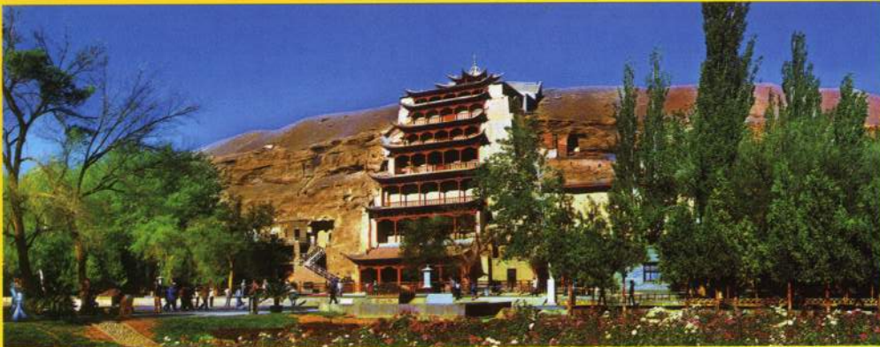
→ Mogao Grottoes of Dunhuang (China)