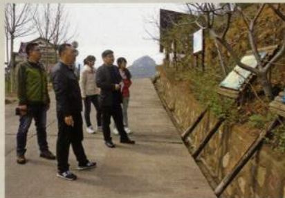
✦ Inspection on the geoheritages

The overall plan, geoheritage conservation plan and science popularization education scheme have been compiled to strengthen the conservation and supervision of geoheritages. The geoheritage conservation database was established and regulations for geopark management and