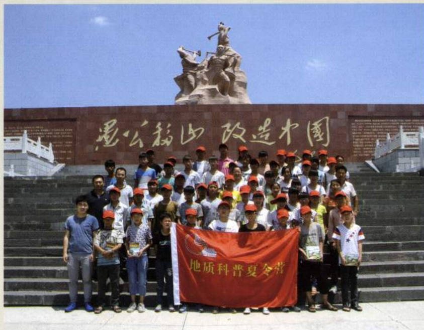
◆ Group photo of Wangwushan-Daimeishan UNESCO Global Geopark geosciences summer camp

In recent years, great progress and outstanding achievements have been made in geoheritage conservation, geoscience popularization, construction and management of the geopark, communication and cooperation in Wangwushan-Daimeishan UNESCO Global Geopark. We have been sticking to the principles of strict conservation, unified management, scientific planning and sustainable use. It has been awarded many honors like "One of the Top Ten Beautiful Landscapes", "the Most Beautiful Geopark of China", "the first prize of Advanced Team Award for Geosciences Education", and "Advanced Team in Land Resources Management System of China".