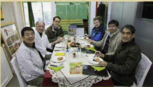
✦ Judging Panel (right)