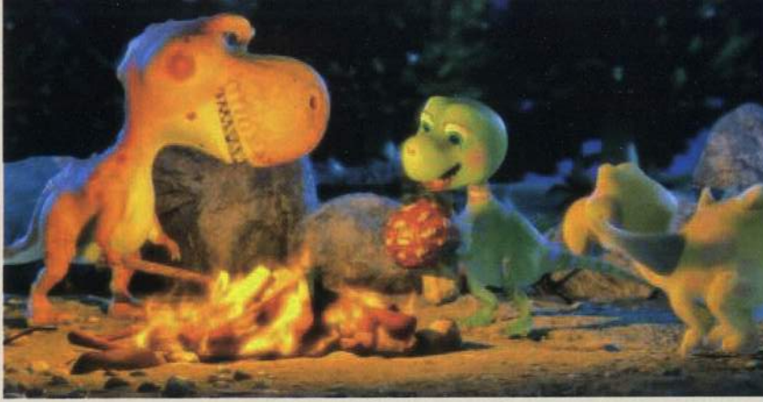
"Jurassic adventure" video screenshot