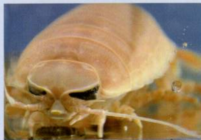
✦ Marine isopod(Bathynomus doederleini)