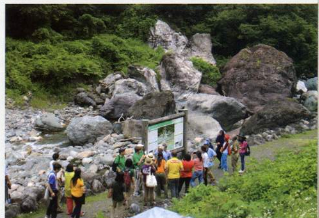
✦ Attendees visit the Kotakigawa Jade Gorge Geosite in Itoigawa UNESCO Global Geopark