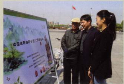
✦ The 10 th anniversary exhibition of Chinese global geoparks