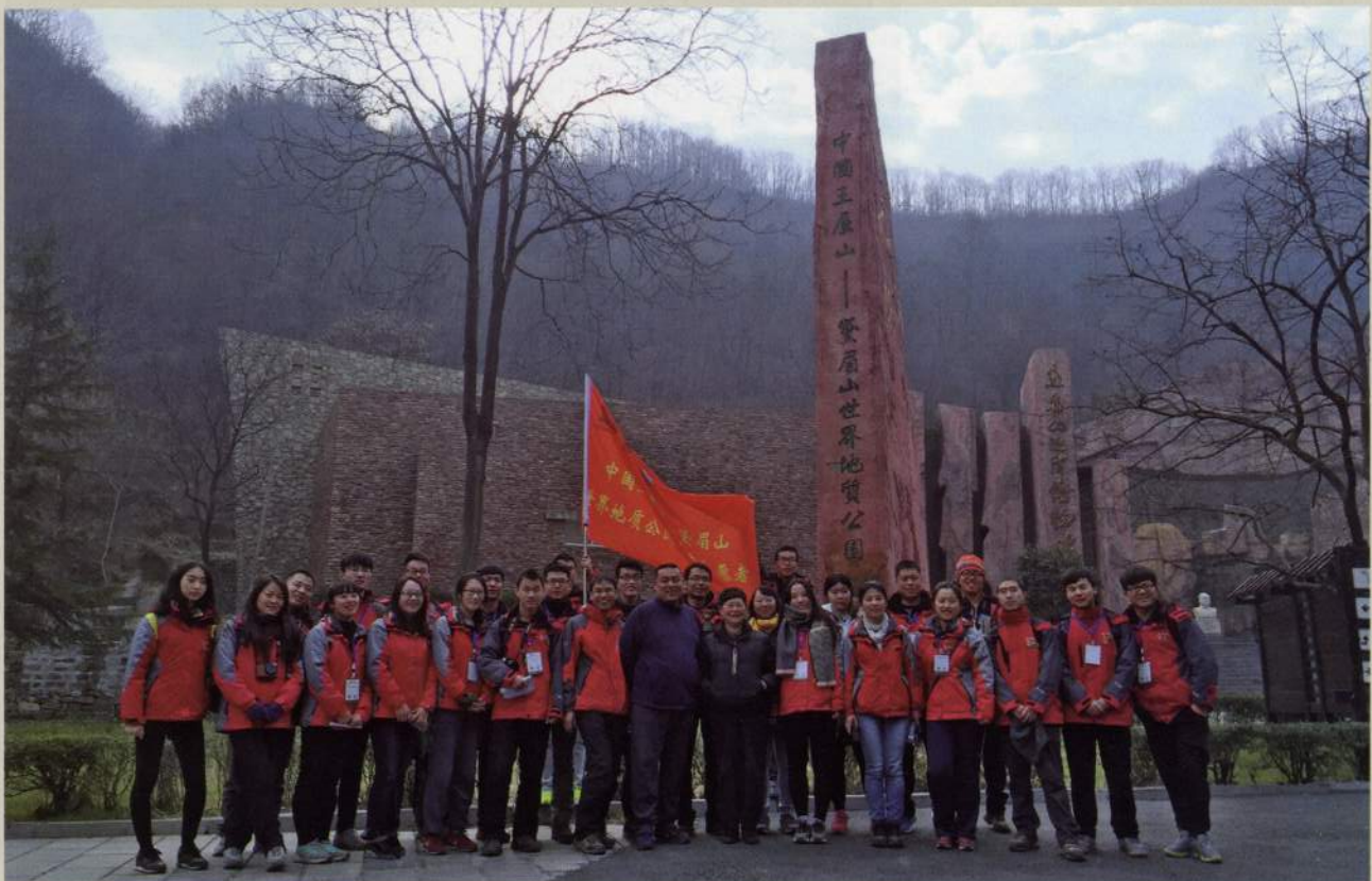
✦ Training camp activity of the popular science volunteer