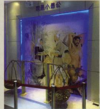
✦ Newly built science popularization education centre ✦ Center of Scientific Education