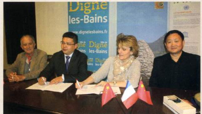
✦ Signing partnership agreement