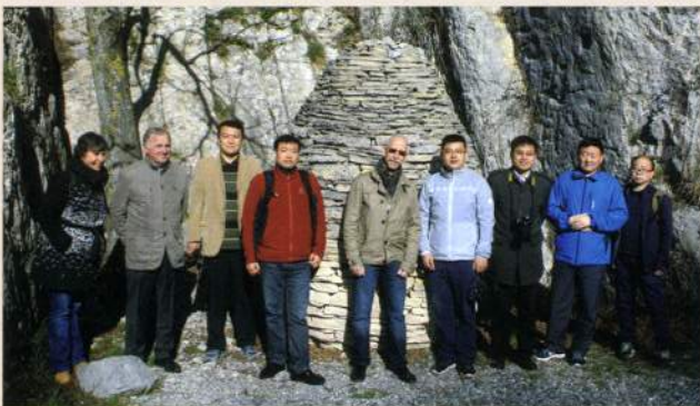
✦ Visiting cultural site