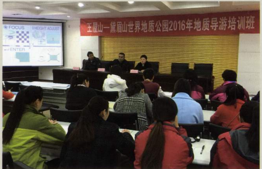
✦ Training camp activity of the popular science volunteer

geoheritages conservation have been issued. Signboards for conservation and interpretative science popularization have been set up at the significant geosites within the geopark; the newly found geoheritages in Jiyuan Basin have been recorded and conserved, and protection fence has been built. Moreover, the geoheritages within the geopark are patrolled on a regular basis; the persons who damage the geoheritages and science popularization signboards will be charged criminal liability.