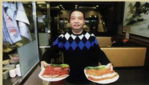
✦ Man Nin Wah Roasted Meat Restaurant: Layer by Layer