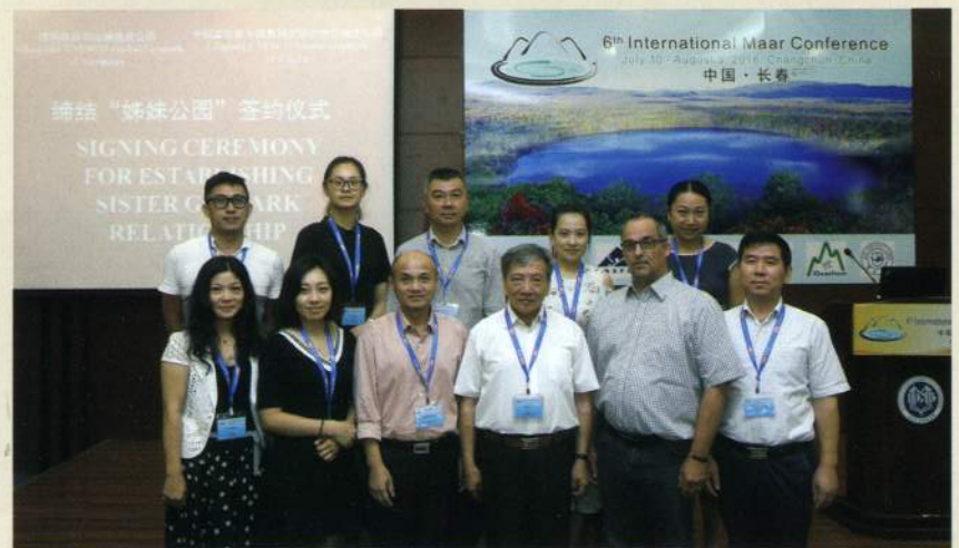
✦ Sister-park cooperation agreement signed by both geoparks

typical representative of Chinese maar lakes. Huguangyan maar lake is one of the best preserved volcanic crater lake in China and even in the world. The sediments of the lake are regarded as a natural yearbook for transition of natural environment. Huguangyan is the starting point for China's research on maar lakes, also an important base for the world's research on maars. The establishment of the Sister