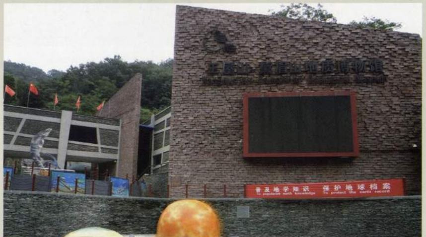
✦ Wangwushan-Daimeishan UNESCO Global Geopark Museum

“Geoscience popularization into school, community and scenic areas” has been carried out. Since 2012, geosciences education activities have been carried out on every Earth Day on 22 April and Geosciences Education Week. The activities including “The 10 th Anniversary Exhibition of Global Geoparks in China”, science popularization lectures, geosciences popularization summer camp, science knowledge contest, agritainment geosciences training, prized collection of geopark photographs, etc. Besides, 25 volunteers from 10 colleges in China have been recruited to carry out science popularization camp activities. The volunteers are encouraged to involve, experience, learn and diffuse the geosciences popularization, geoheritage conservation and special characteristic economy by Wechat and blog, etc. to comprehensively promote the reputation and influence of Wangwushan-Daimeishan UNESCO Global Geopark.