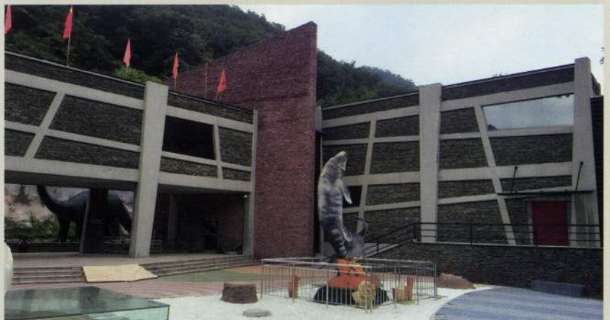
✦ Wangwushan-Daimeishan UNESCO Global Geopark Museum