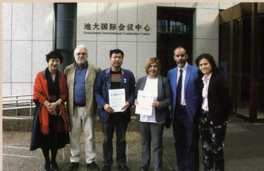
◆ Representatives of the two geoparks