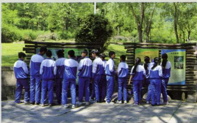
◆ Group photo of Wangwushan-Daimeishan UNESCO Global Geopark geosciences summer camp