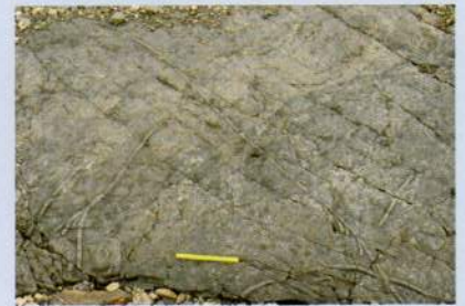
✦ trace fossil