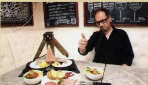
✦ Chez Raymond De Paris: Lava-like Assorted Melting Cheese