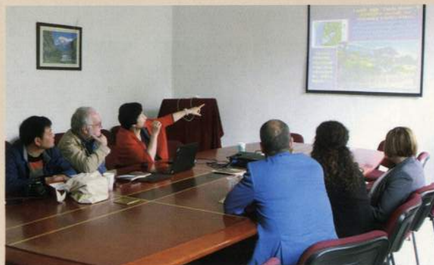
◆ Introducing Shennongjia Geopark