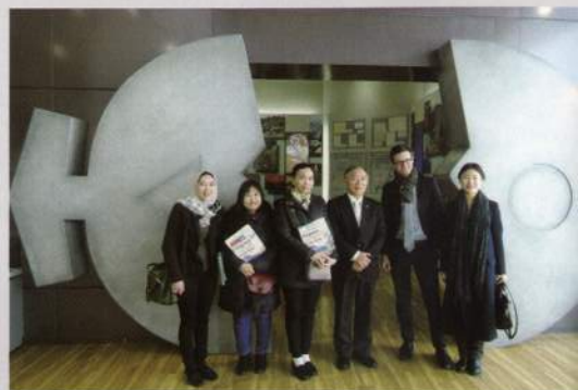
◆ Group photo at the Oyashirazu Geosite