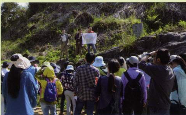
◆ Experts are visiting the Hanchangchong scientific spot

were interested in the outcropped eclogite, garnet peridotite and jadeite quartzite, and they made a discussion and communication. Experts fully affirmed the progressive work Tianzhushan had achieved in the protection of geological heritage, geo-science popularization and the development of geo-tourism. The geopark provides an interactive platform between geologists and the common people, popularizes the geosciences, disseminates the scientific knowledge, enhances the awareness of environmental protection, and promotes the sustainable development of regional economy and society.