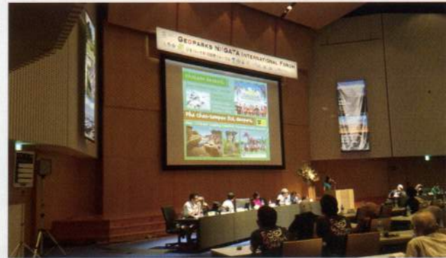
✦ A representative from Thailand presents on Geopark Activities there

Following the forum, attendees took part in one of two excursions, either to Sado Island Geopark or Itoigawa UNESCO Global Geopark. Visitors to Itoigawa explored the story of the world's oldest jade working culture, born along a plate boundary.