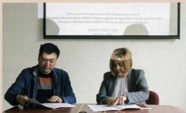
◆ Signing sister-park agreement

After the meeting the representatives of both parks signed the sister-park agreement. According to the agreement, the two parks will carry out exchanges and cooperation in respects of geopark development and management, geoscience research and education, geotourism promotion and capacity building, etc.