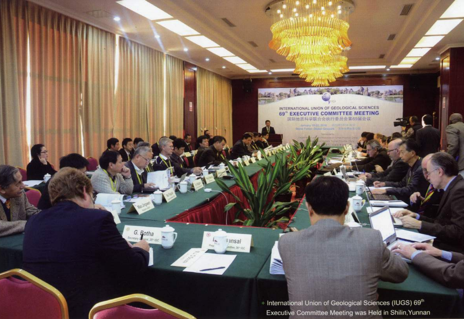
International Union of Geological Sciences (IUGS) 69 th Executive Committee Meeting was Held in Shilin, Yunnan