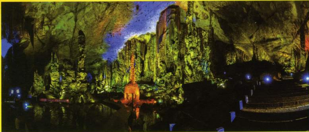
→ Zhijindong Cave(China)