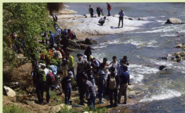
◆ Experts are visiting the Xindian scientific spot