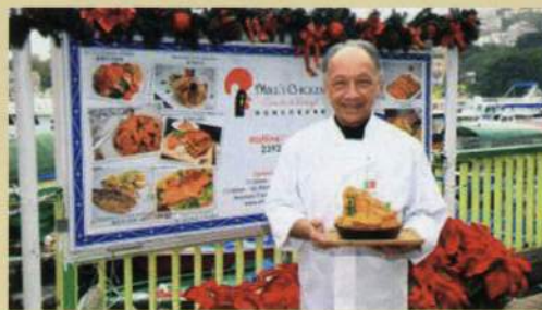
✦ Mike's Chicken Comida de Portugal: Portuguese Geo-Toast

creative ideas with the HKGP staff when preparing their creations. "We're delighted to work together with other stakeholders to promote our food and Hong Kong Global Geopark at the same time," said one chef.