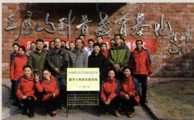
◆ Sign the agreement about Teaching and Science Study Practice Base between Henan polytechnic University and Wangwushan-Daimeishan Global Geopark to build friendly and cooperative relationship.

Great importance has been attached to the comprehensive rectification based on the six recommendations given by the experts in last revalidation. The leading group for rectification has been established and improvement plan has been made. Many improvements including infrastructure construction, newly built science popularization education centre